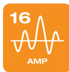
Connects to any 16A (3 phase) charging unit or station with a type 2 connection.

Charge at home and on the moveType 2 to Type27 PIN | 3PHASE