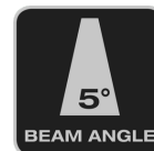
Beam angle 5° Exceptionally focused beam angle