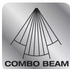
Combo Beam Combined beam of light