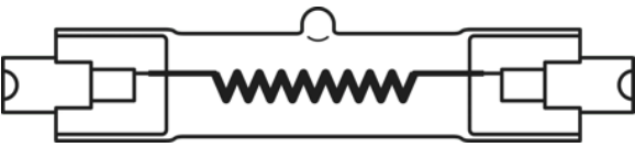
HALOGEN STUDIO LAMP 64571, 64572